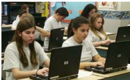
Expanding horizons using technology

The excitement at St. Mary Magdalen School was palpable when I visited in April with construction about to begin on a new 12,000 sq. ft. addition to the school. The addition will house a gymnasium which will also serve as a parish and school meeting center and special event space. Also included in the project is a two-level addition which will house an integrated early learning center and comprehensive library-media center including state of the art computer assisted reference tools. Pre-K classes will move to the new space allowing for the